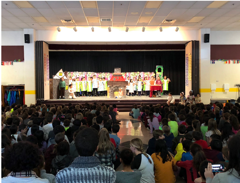
The Gold Cast performs for a packed auditorium during the school day in the cafeteria.

Props are well-deserved for the Baker's Wife (Meera) because she